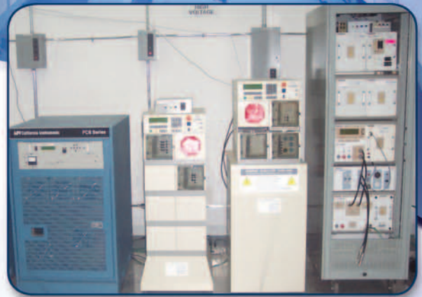
Power quality, functional verification and CE/NEBS compliance testing.