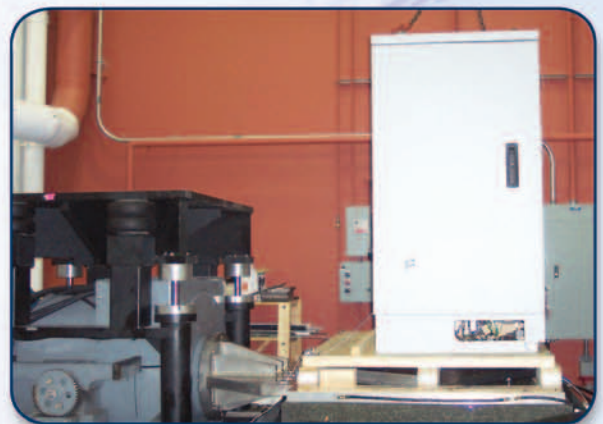
Vibration testing for up to 2500lbs payload.