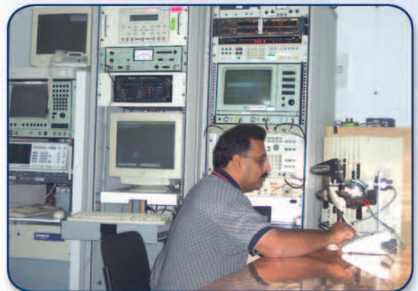
Accredited telephone network interface testing.