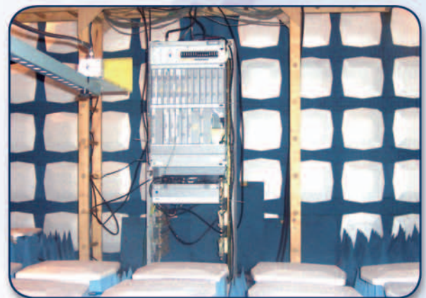
Uncompromised quality in dedicated 3m immunity test chamber.